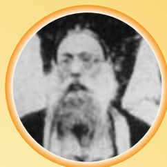
Archbishop Mar Ivanios OIC