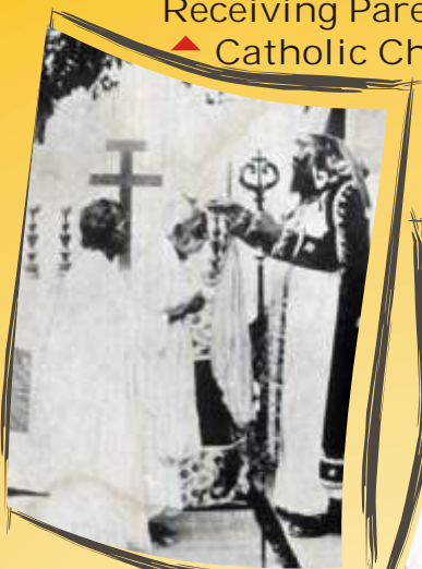
Receiving Parents into ▲ Catholic Church