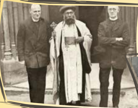
31st International Eucharistic Congress in Dublin, Ireland ▶