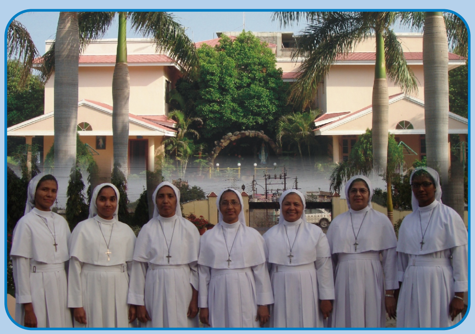
The Exarchate Congratulates all sister of the DM Congregation on the elevation of Amal Vice Province to the Status of a Province