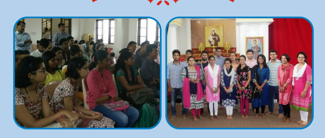
MCYM Resource Team Session at Singasandra, Hennur, Matikere, Khadki & Warje Parishes