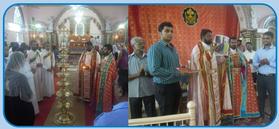
Inauguration of Various Organisations and Releasing of MCYM Annual Program, Kalewadi