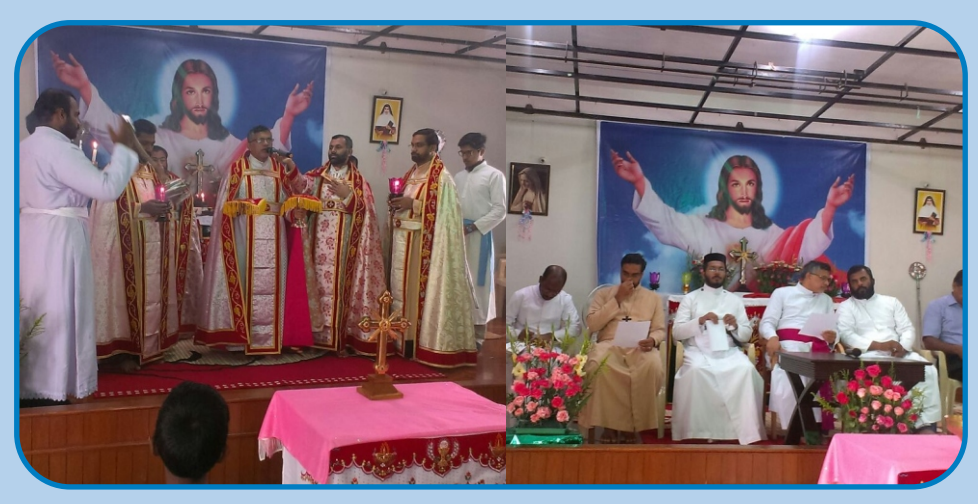
Inauguration of St. Alphonsa MSCC, Carmelaram - Bangalore