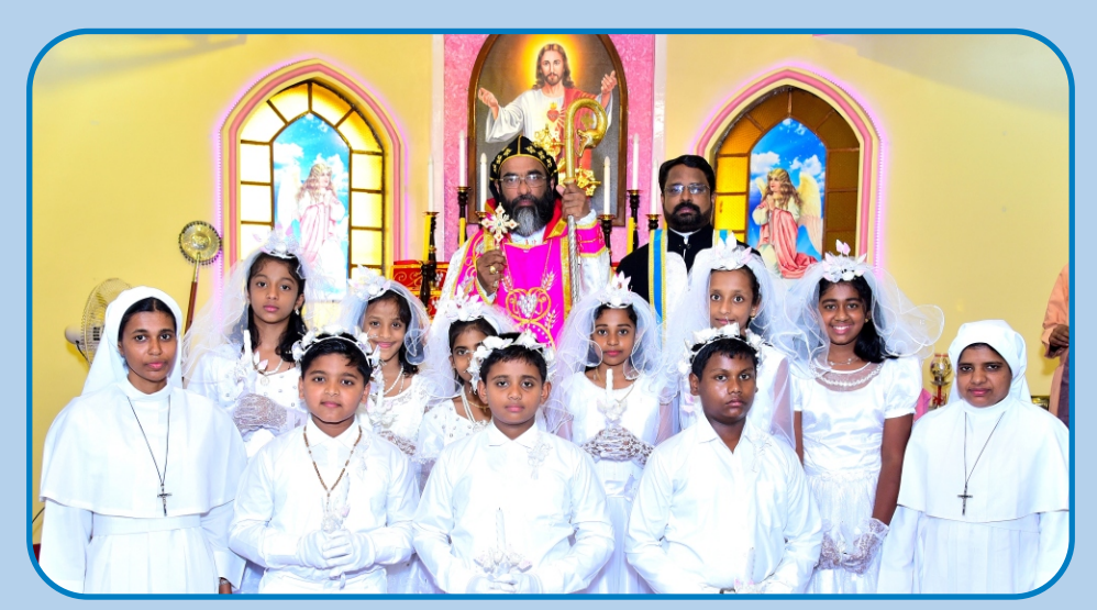
First Holy Communion at Vishrantwadi Parish