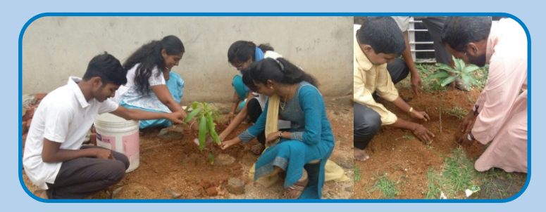
Sapling plantation on World Environment Day, Hyderabad