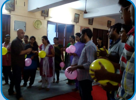
MCYM Resource Team Formation Bengaluru & Chennai