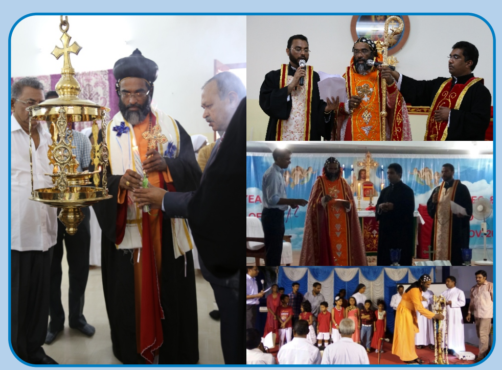
Blessing of the Chapel at Mar Gregorios College & Festal Celebration at Padi, Chennai