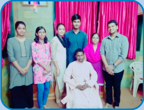
Father's Day Celebration & the MCYM Core Committe, Dombivili