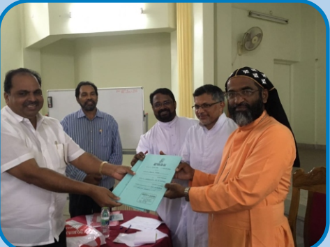
The Khopoli Land Deed Handed over to the Bishop