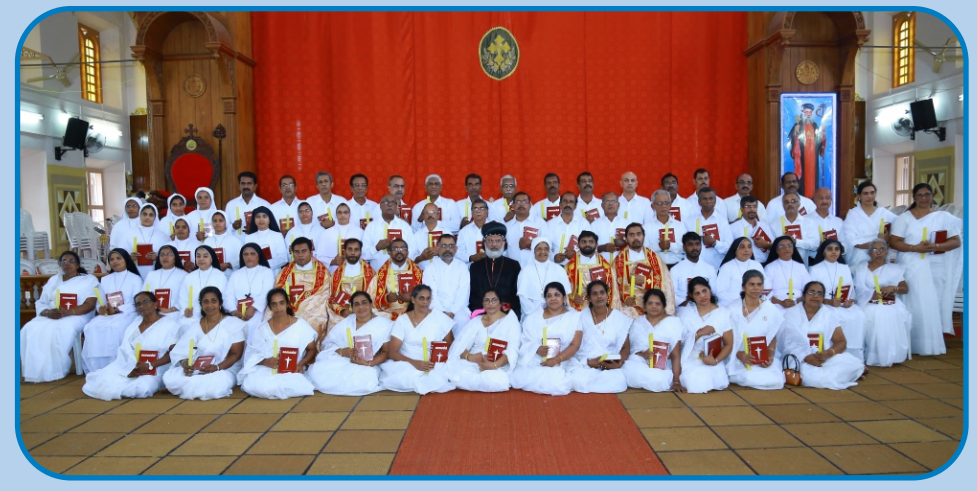
The Third Batch of Suviseshsangham Members, Trivandrum