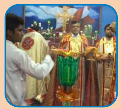
Festal Holy Qurbono at Hyderabad