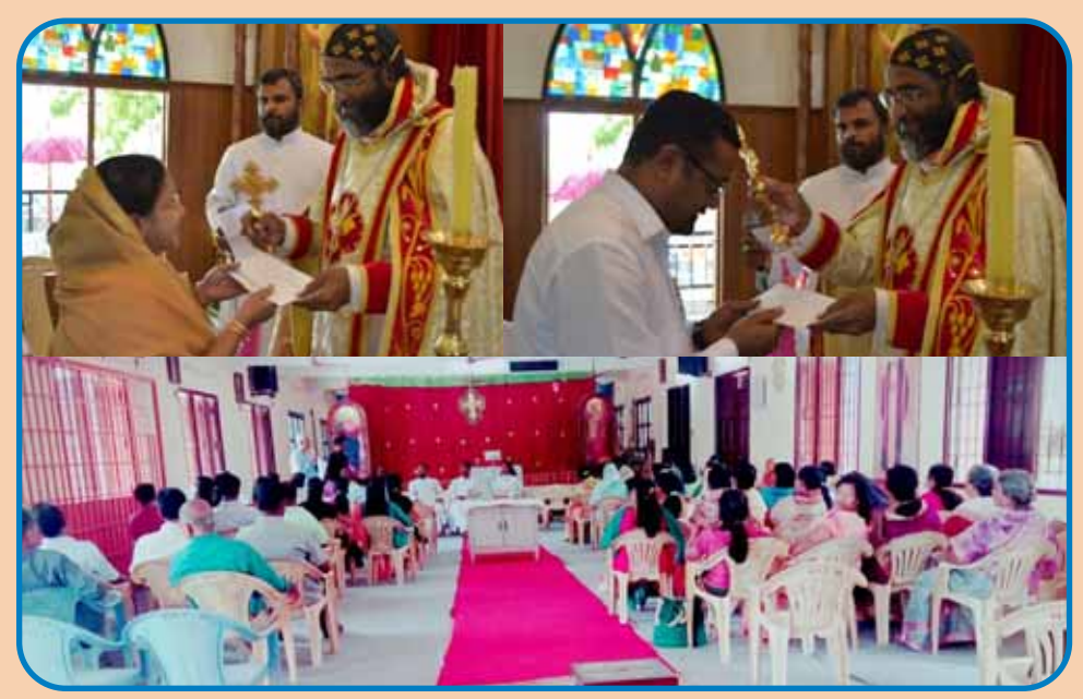
The Inauguration of Prabodhanam by the MCA & Mathrusangham in Bangalore & Chennai