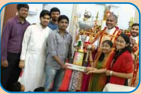
The Sakinaka MCYM receives the Y'Zest trophy