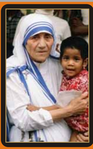
Saint Mother Theresa Pray for us! (5 September)