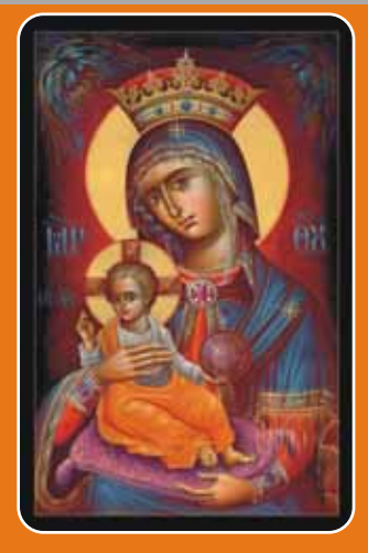
The Nativity of our Lady (8 September)