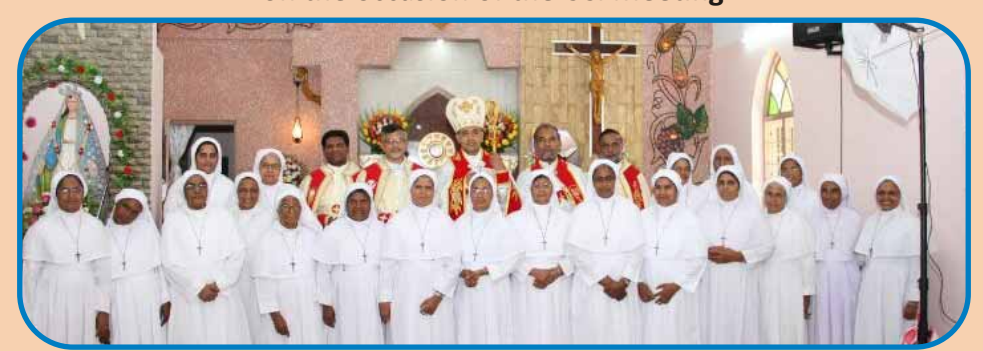
The elevation of the DM Amala Vice-Province to the status of a province, Wardha