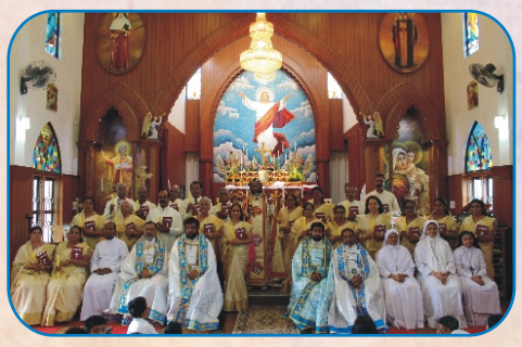
Suvisesha Sangham kaiveppu, Mumbai & Bangalore