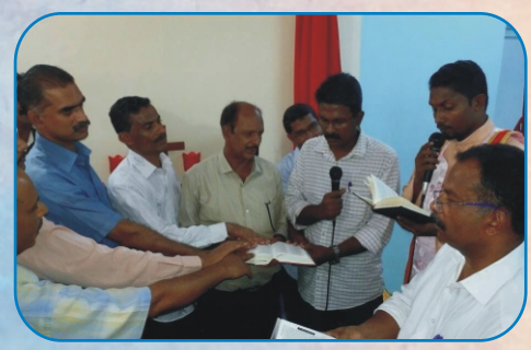
Oath Taking by the New Committee, Dombivali