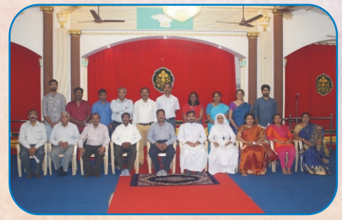
Parish Committee, Sakinaka