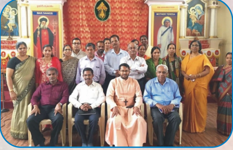
District MCA Representatives' visit to Warje Parish