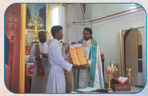
Inauguration of MCYM Annual Program, Dombivali & Warje