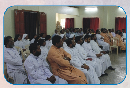
Minor Orders And Parents Meet of the Seminarians