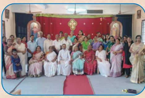
Suvisesha Sangham Formation, Nagpur & Padi