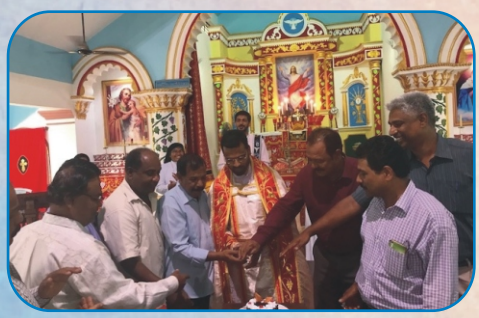
Father's Day, Dehuroad