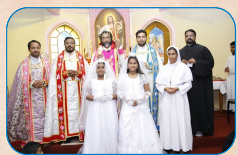
St Antony's Festal Celebration, Vishrathwadi