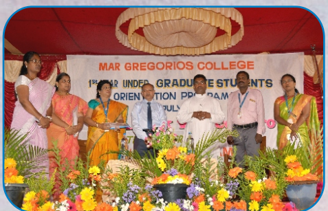
Orientation Program, Mar Gregorios College