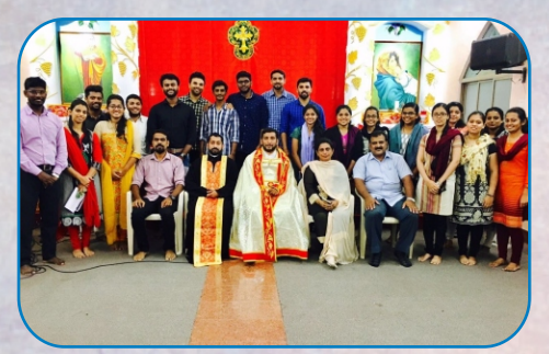
Dehu Road and Chinchwad