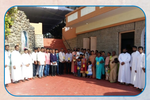
At Pattom Cathedral