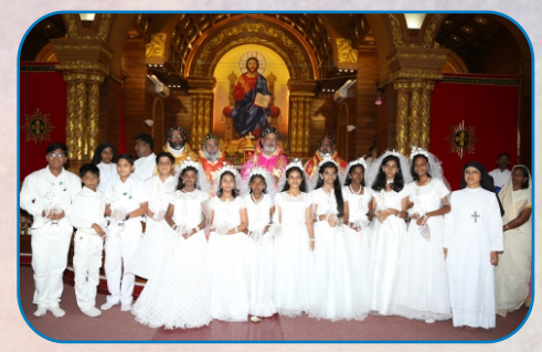
Glimpses of the Mar Ivanios Day, Trivandrum