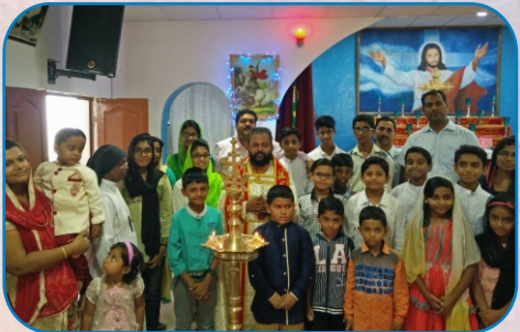
MCCL Day, Picket - Hyderabad