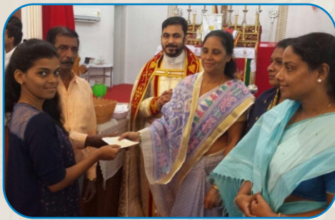
Charity Donation, Sakinaka