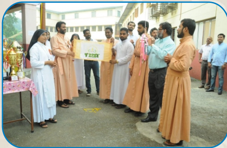
Y-ZEST, Arts Festival - Mumbai District