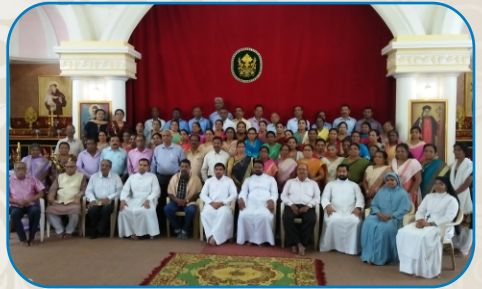
MCA and Mathrusangham Seminar, Pune District