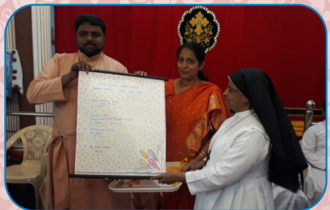
Releasing of Mathrusangham Annual Agenda, Mumbai