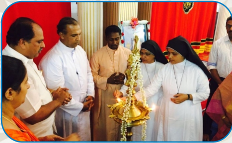
Inauguration of Family Counselling, Mumbai