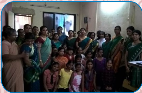
Visit to Orphanage, Thane Mathrusangham