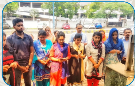
Rosary at the Grotto, Khadki