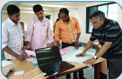
Training the Women and participation in CSR Connectivity Workshop in ARC Center at Panvel by SEVA