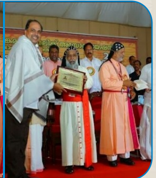
Missionaries and Entrepreneurs from the Exarchate being Honoured