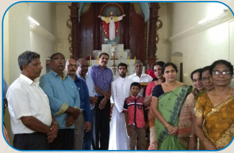
One Day Retreat, Goa