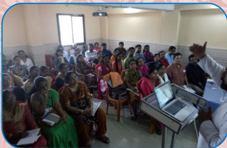
Mumbai District Catechism Teachers' Seminar