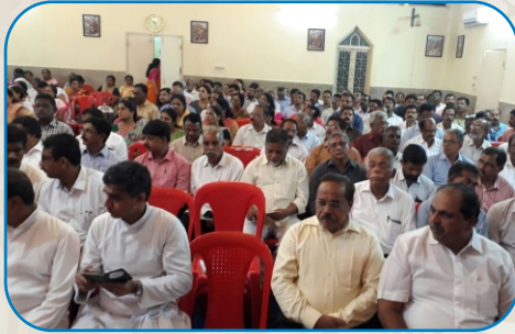
MCA and Mathrusangham Family Counselling, Mumbai District