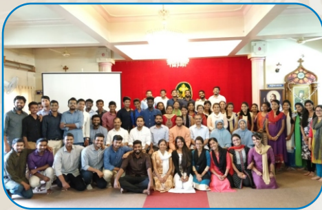
Debate Competition Pune