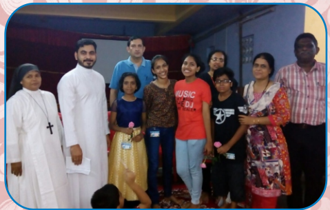
Newly Elected MCCL Leaders with Mumbai District Executives