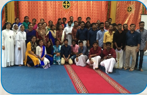
One Day Seminar, Ayappakam - Chennai