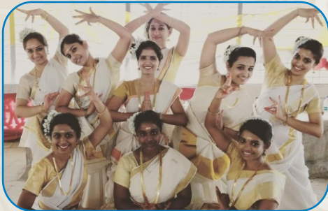
Onam Celebration, Vishratwadi & Dehu Road