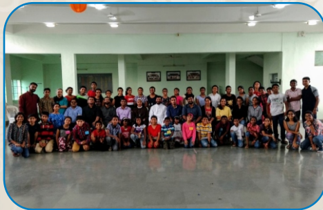
Mar Ivanios Prayer Group with the Children of Carmel Syro-Malabar Church, Pune