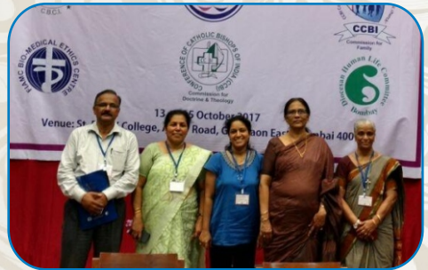
The Exarchial Members at National Symposium, Mumbai