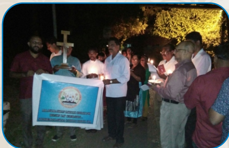
Reunion Day Celebration, Goa