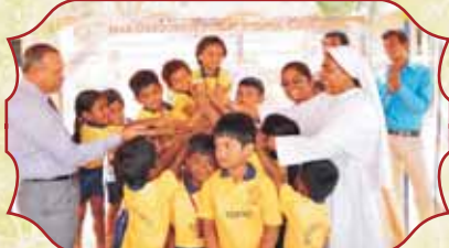
Mar Gregorios CBSE School Sports Day, Chennai