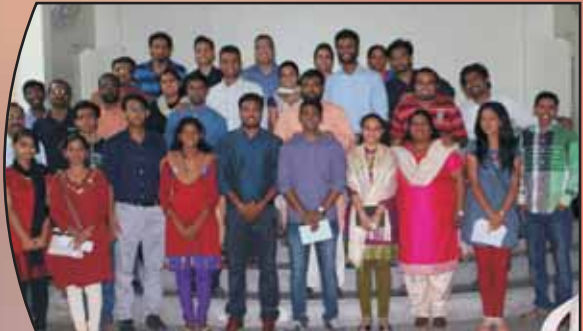
MCYM Resource Team - Pune District