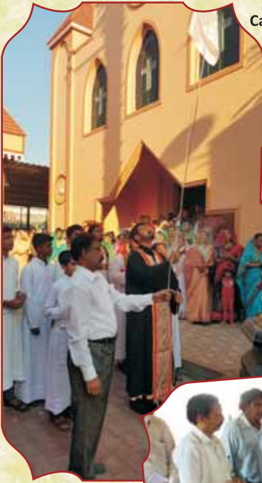
Catholicos Day Celebrations, Kalewadi