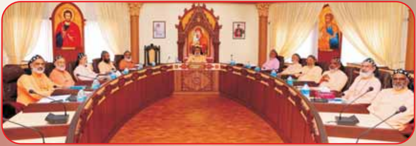
19th Holy Episcopal Synod of the Malankara Syrian Catholic Church, Trivandrum