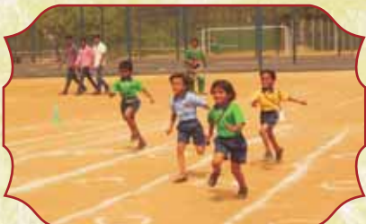
Mar Gregorios CBSE School Sports Day, Chennai