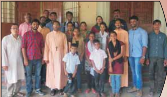
MCYM Class & Interaction Initiated by Resource Team - Warje Malwadi