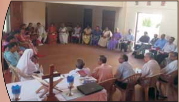
Suvisesha Sangham Formation in Pune District