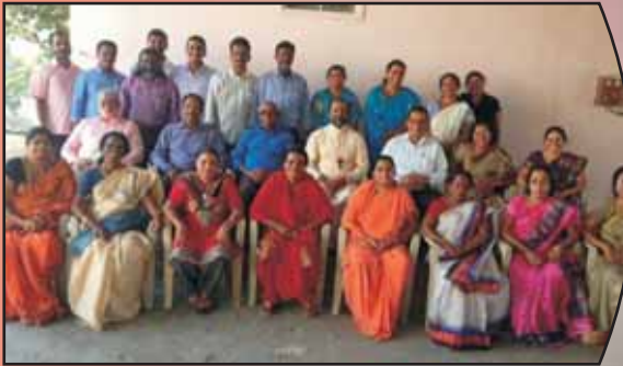
Suvisesha Sangham Team in Hyderabad District