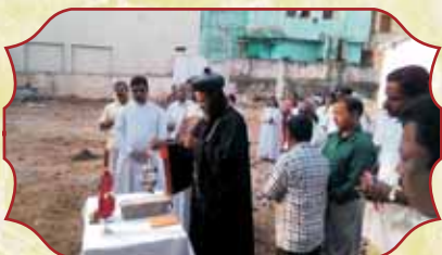
Foundation Stone for Presbytery at Chennai laid by the Exarch