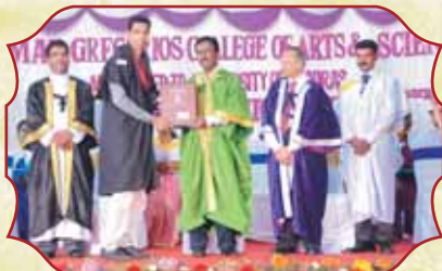
Mar Gregorios College - Graduation Day