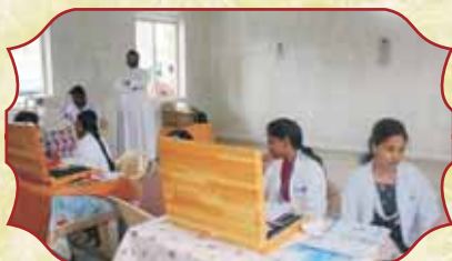
Eye Testing Camp - Sacred Heart Matriculation School, Chennai