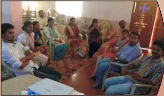
MCYM Resource Team Formation - Hyderabad District