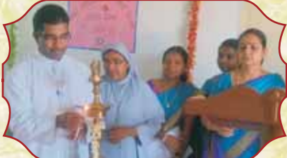
Mar Gregorios CBSE School Arts Day Inauguration, Chennai