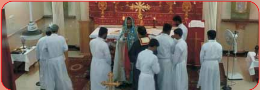
The Exarch celebrates Holy Qurbono at St Mary's MSCC, Khargar