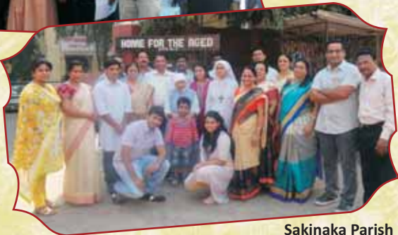
Sakinaka Parish visits Home for the Aged