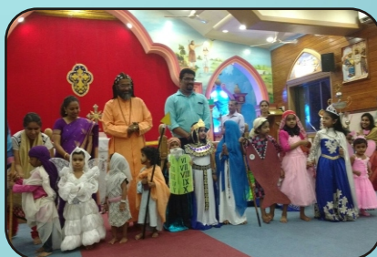
Kids of Borivili Parish with the Bishop