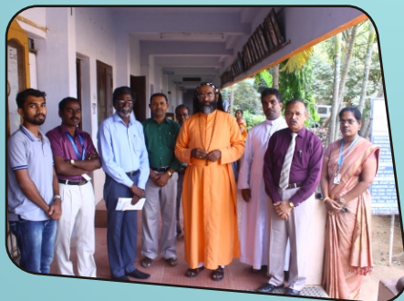
Mar Gregorios Centenary Charitable Program : Donation for a cancer patient and house for Flood victim of Chennai