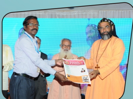
Releasing of the college bulletin entitled "Jyothir"