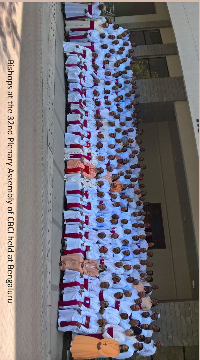
Bishops at the 32nd Plenary Assembly of CBCI held at Bengaluru

Printed and Published by The Chancellor, Exarchate of St Ephrem 51 Bhaupatli Road, Bhopadi, Pune - 411 020. Tel.: +91 9145273369. Email : ephremite@gmail.com