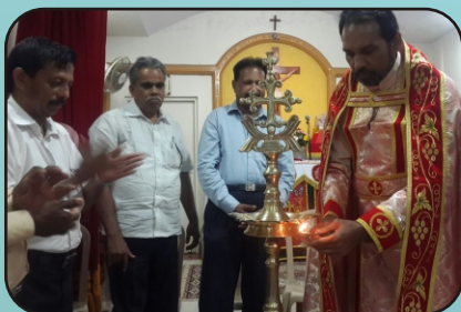
MCA Inauguration - BARC