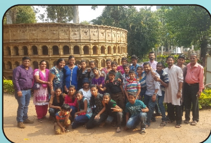
Catechism Picnic, Kalewadi Parish