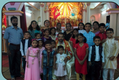
MCCL Day - Kharghar