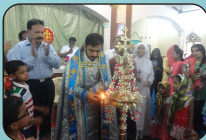
MCA Inauguration - Sakinaka