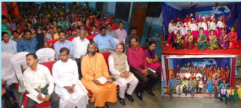
Annual Day Celebration of St Thomas Malankara School, Borivili