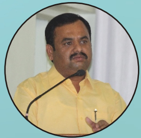
Shri. Prashant Jagtap (Mayor- PMC)