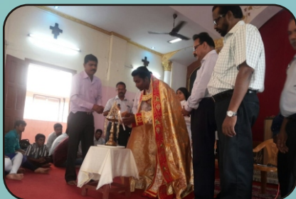
MCA Inauguration - Ulhasnagar