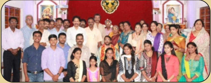
Aurangabad Parish Community on Easter Day Celebration

The New Malankara Community at Thamparam, Chennai