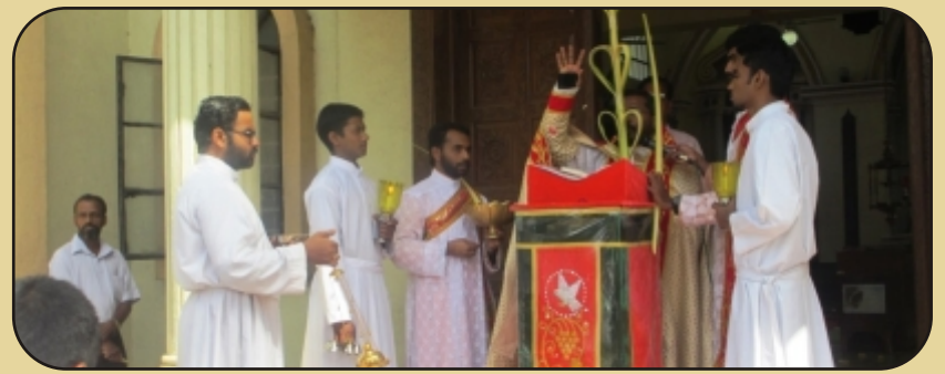
Holy Week Service at Warje Malwadi