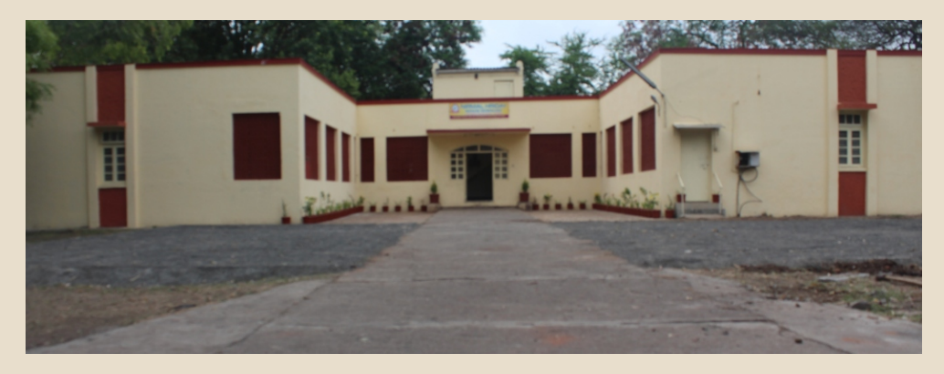
Blessing and Inauguration of Nirmal Hriday Minor Seminary