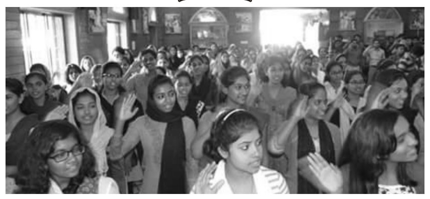
Mahanaim - Mumbai Distict MCYM Retreat