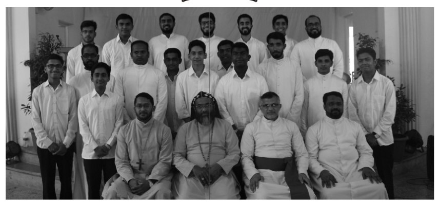
The Seminarians with the Bishop & other priests of the Exarchate