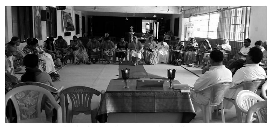
Suvisesha Sangham Formation in Chennai