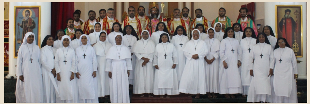
Meet of the religious serving in the Exarchate with their major superiors