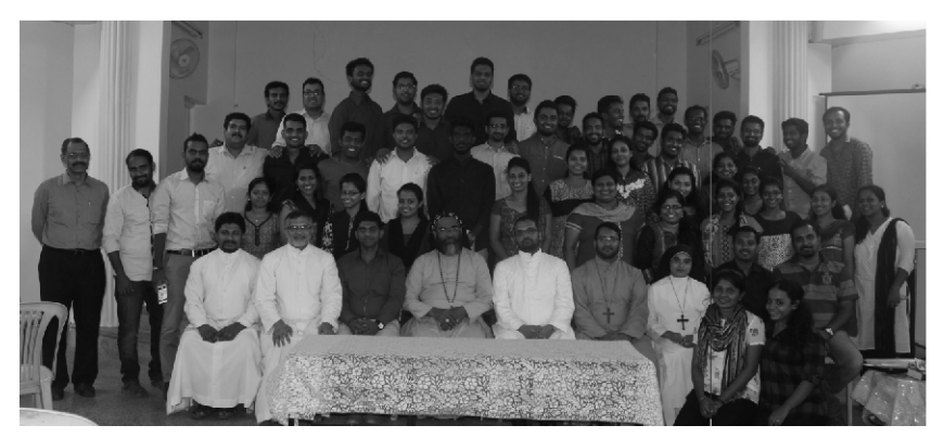
Exarchial MCYM Senate Meet at Khadki