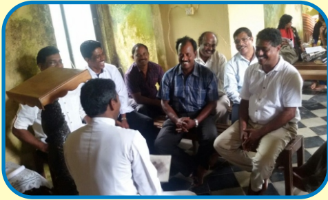
Committee Meeting & Night Vigil, Goa