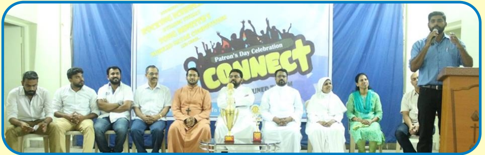
MCYM Patron's Day Celebration, Pune District