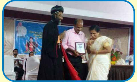
Reunion Day Celebration, Mumbai