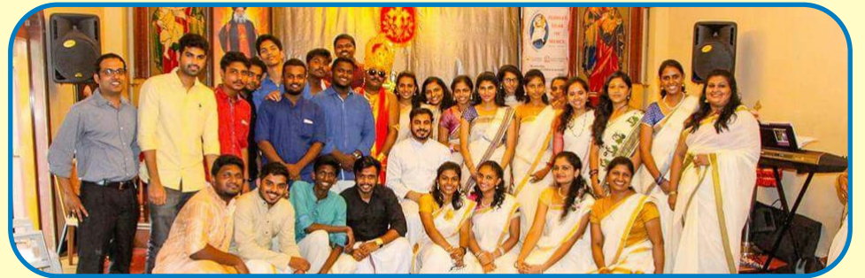
Onam Celebration, Vikhroli