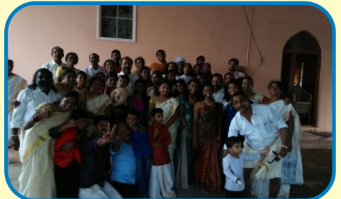
Onam Celebration, Jeedimetla