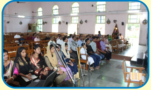
The Malankara Community Prays in the Cathedral Church, Aurangabad