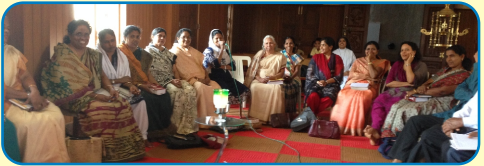
Suvisesha Sangham Formation, Bengaluru