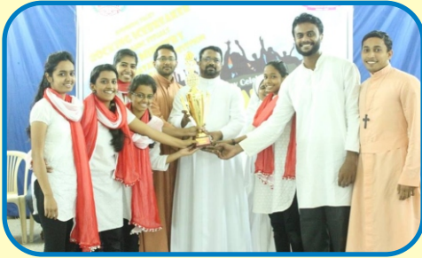
MCYM Warje Bags First Prize for Street Play Competition