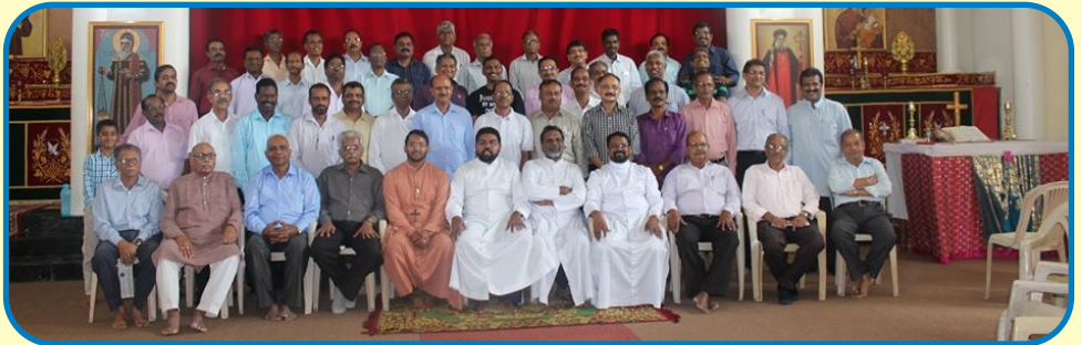
MCA & Mathrusangham Seminar, Khadki