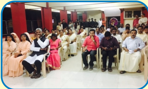
Onam Celebration, Chinchwad