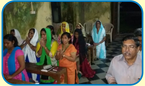
Orphanage Visit, Hennur