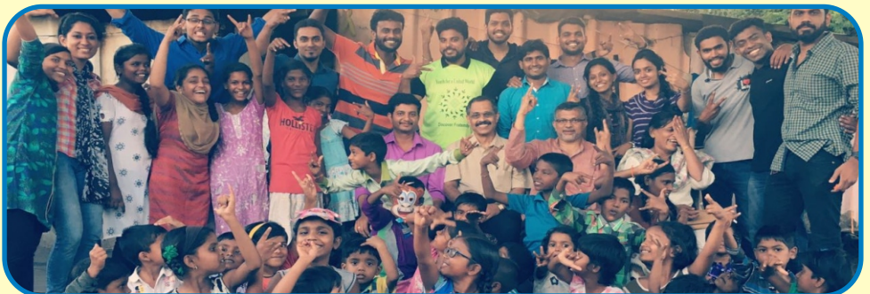
MCYM with SEVA Kids, Pune District