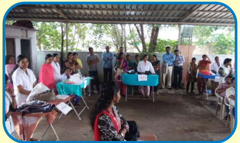
FAMYS Medical Camp, Jeedimetla