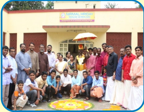
Onam Celebration at Nirmal Hriday Seminary