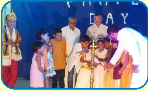
Family Day and Onam Celebration Khadki