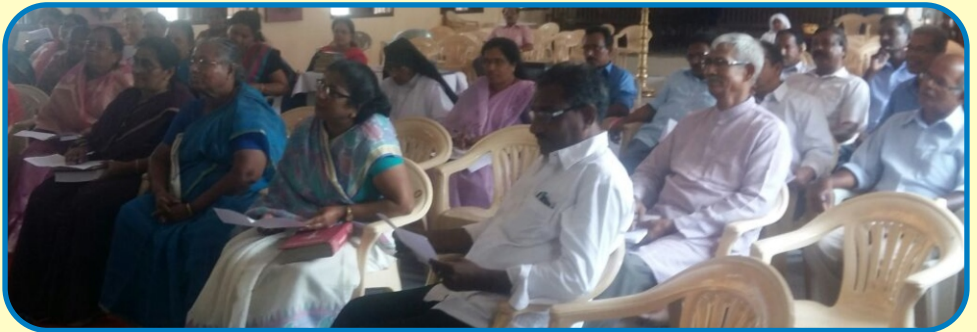
Suvisesha Sangham Formation, Chennai