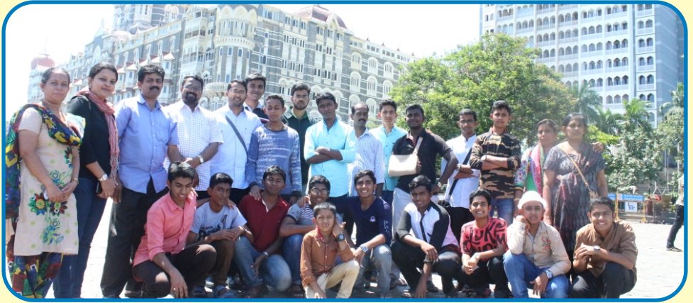
Minor Seminarians Picnic to Mumbai