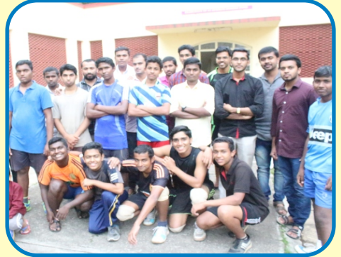
Minor Seminarians with the Malankara Seminarians from Papal Seminary, Pune