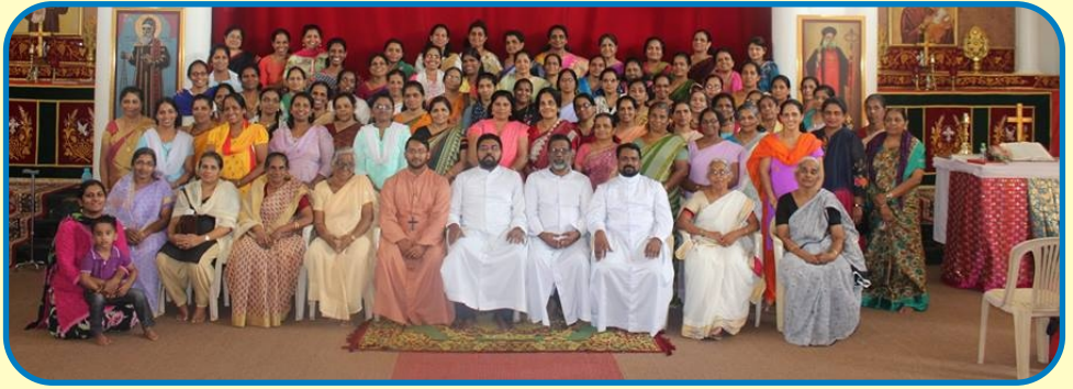
MCA & Mathrusangham Seminar, Khadki