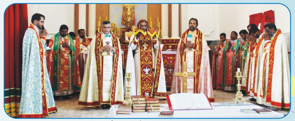
Exarchate Priests Meet, Pune