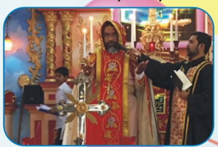
Festal Celebration, Borivali