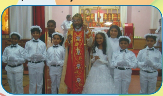
First Holy Communion, Thane