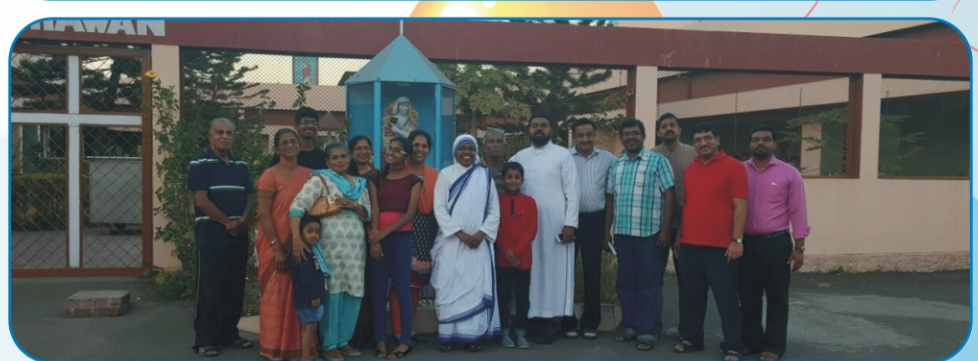
The Cathedral Parishioner's visit Prerana Bhavan