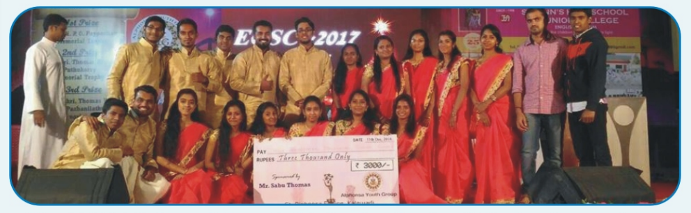
The MCYM Kalewadi bags 3rd Prize for the Carol Singing Competition