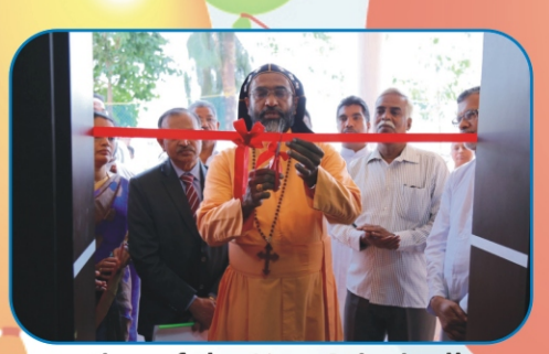
Foundation Stone Laying and Inauguration of the New Principal's Office of Mar Gregorios Public School, Chennai