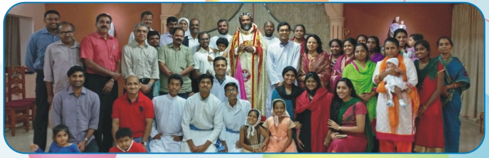
Bishop's Visits to Carmelaram Parish