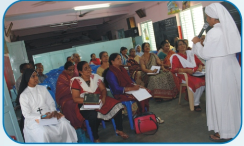
Suvisesha Sangham Formation, Bangalore and Chennai