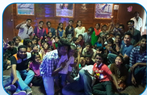
Karunalaya visit by Hyderabad Parish