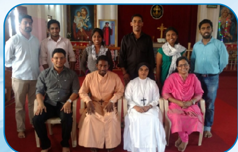
MCYM Executive Body, Ulhasnagar