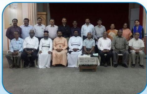
St Thomas Ecumenical Christian Association, Kalewadi-Pune