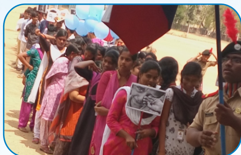
Child Protection Awareness Rally, MGC