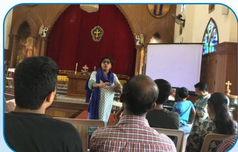
MCYM Resource Team Formation , Bangalore