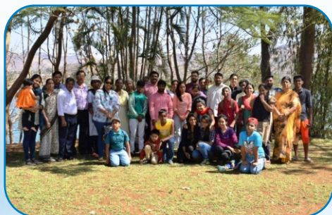
Parish Picnic, Warje Malwadi