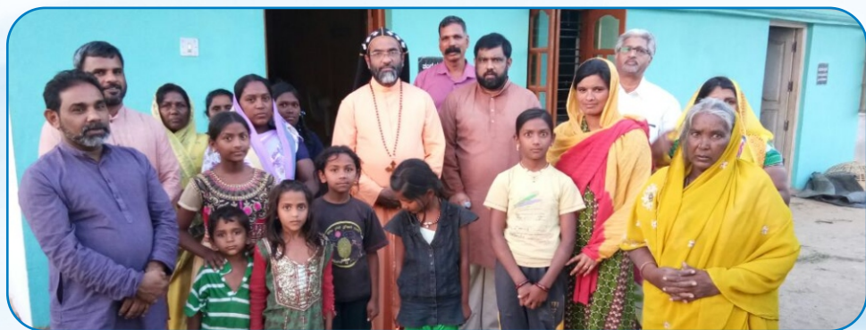
Visit to Mission in Devanahalli, Bengaluru