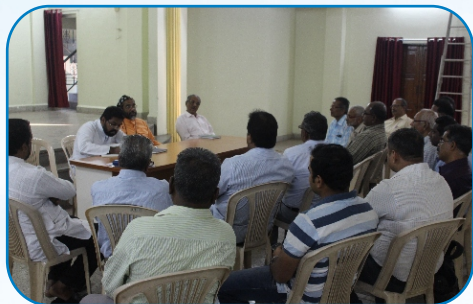
Pune District Pastoral Council Meet