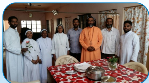
Bishop on a visit to Vincentian Fathers Mission, Ahmednagar