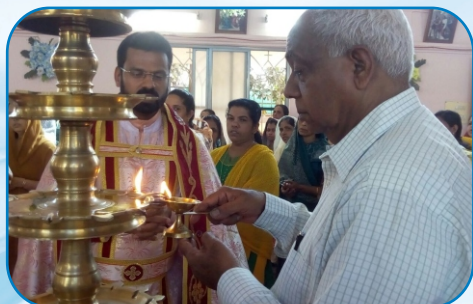
Suvisesha Sangham Inauguration, Kalewadi