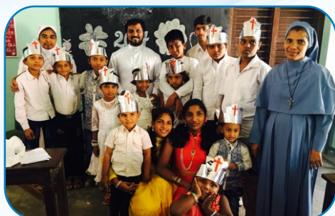
MCCL Day, Ayappakam - Chennai