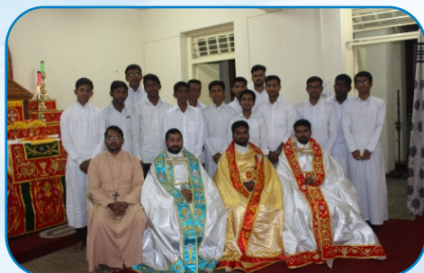
The New Priests with the Seminarians, Pune