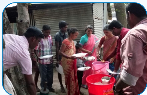
Food for Hungry, Chennai