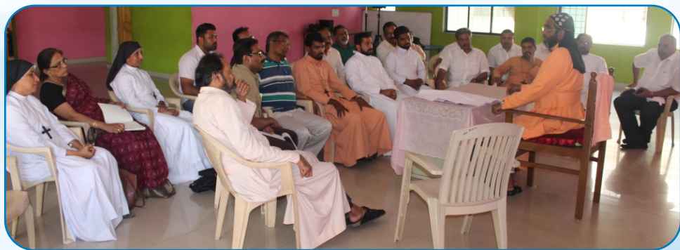
Mumbai District Pastoral Council Meet