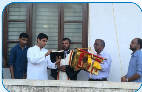
Parish Feast Day, Singasandra