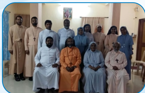
Pune District Priests & Religious Meet