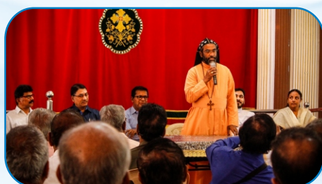
Bishop Addresses the Recollection of Vincent D'Paul Society, Sakinaka