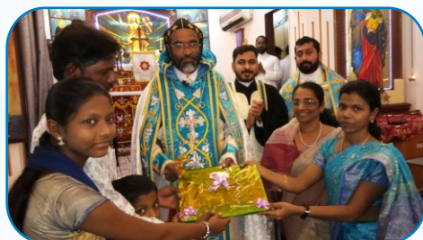
A house for the shelter-less, Vikhroli