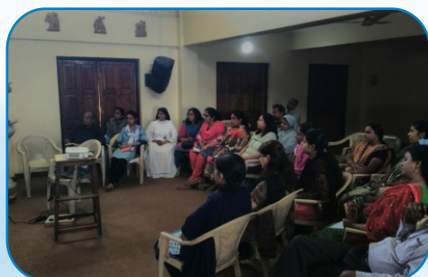
Sunday School Teachers Seminar, Pune District