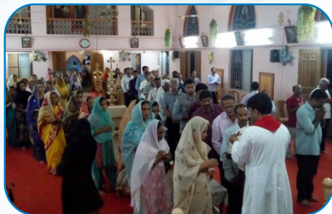
Lenten Retreat, Kalewadi