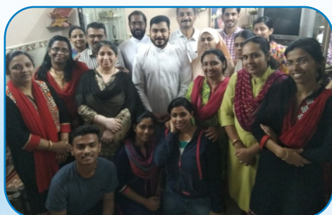
Catechism Teacher's House Visit, Sakinaka