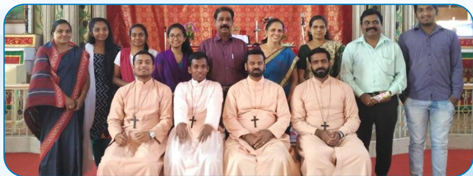
Family Quiz Winners, Kalewadi