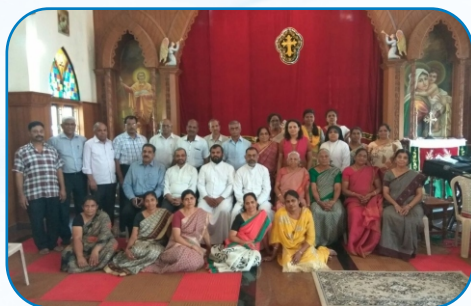
Suvisesha Sangham, Mumbai