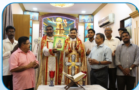
Releasing of the Parish Directory, Vikhroli