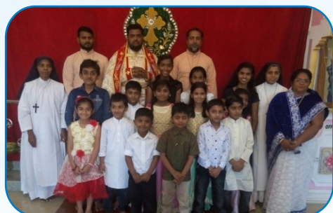
MCCL Day Celebration, Hyderabad