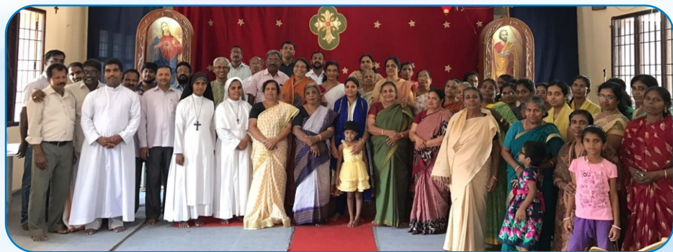
Suvisesha Sangham, Chennai