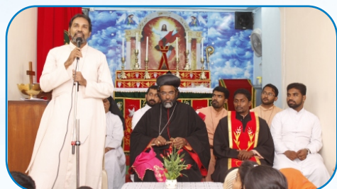
Community Hall Blessing, Dombivali