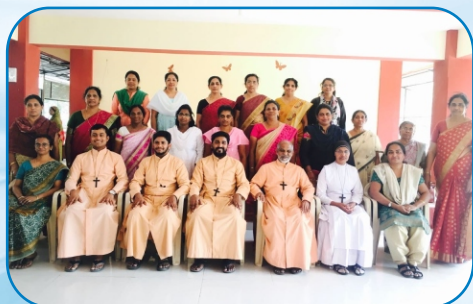
Mathrusangham Arts & Sports Day, Chinchwad Parish