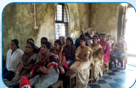
One Day Retreat, Goa