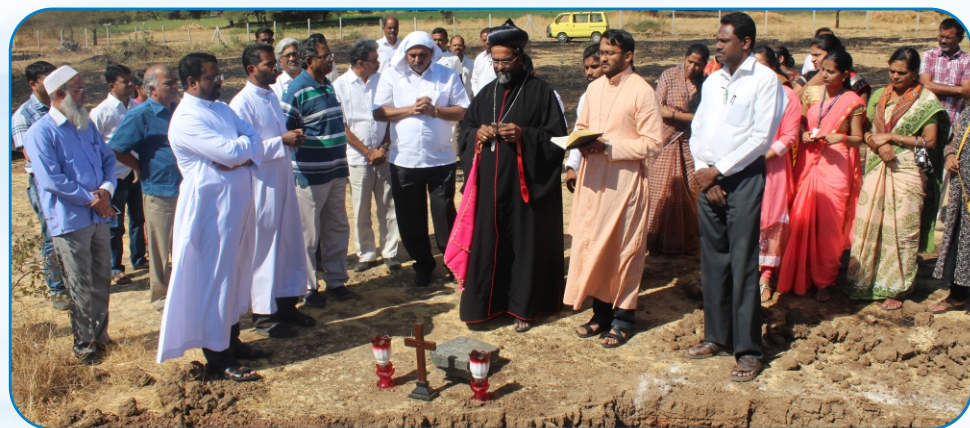
Foundation Stone Laying of St Thomas Malankara School, Nashik