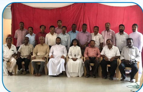
Newly Elected MCA Members, Padi