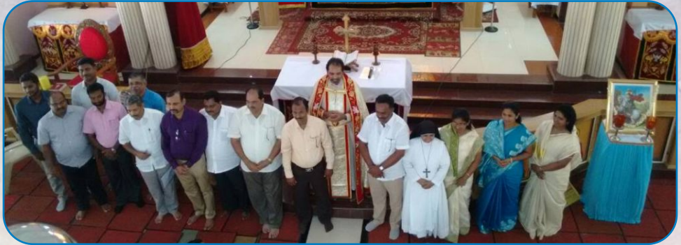
New Church Committee, Kharghar