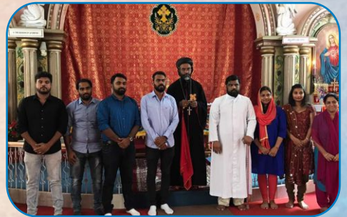
MCYM YIELD 2017 Exarchial Senate, Leadership Meet & Oath Taking Ceremony