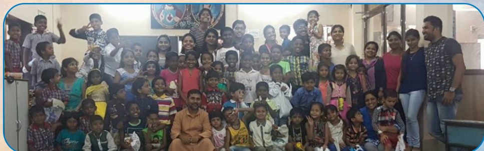
Children's Summer Camp, Borivali