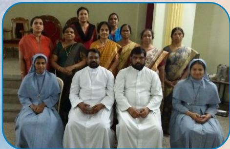
Pune District Mathrusangham and MCA Executive Committee