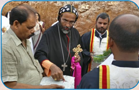
Foundation Stone Laying for the New Church-Carmelaram, Bengaluru