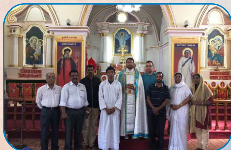
The New Church Committee, Warje