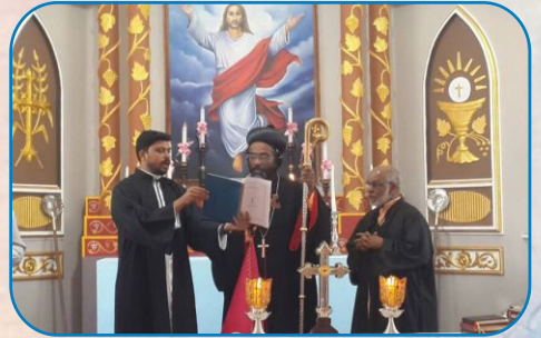
Re-dedication of St Thomas MSCC, Chinchwad