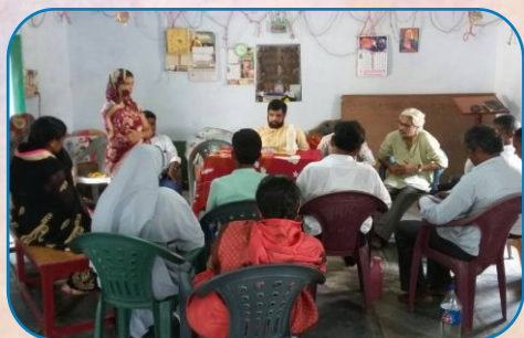
Mission Meet, Bapatla