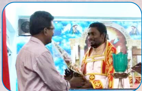
Festal Celebration of Vicar, Dombivali