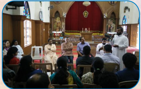
MCYM Senate Meeting, Bengaluru