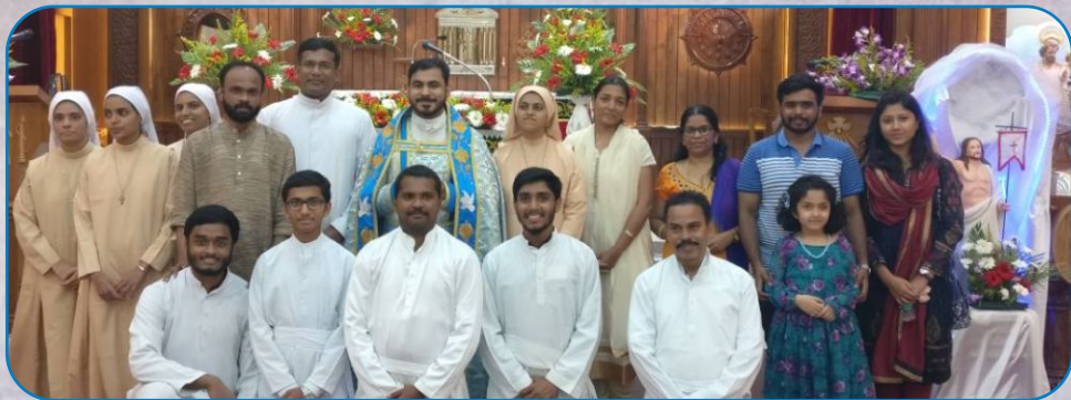
Malankara Qurbano at Syro Malabar Church, Andheri