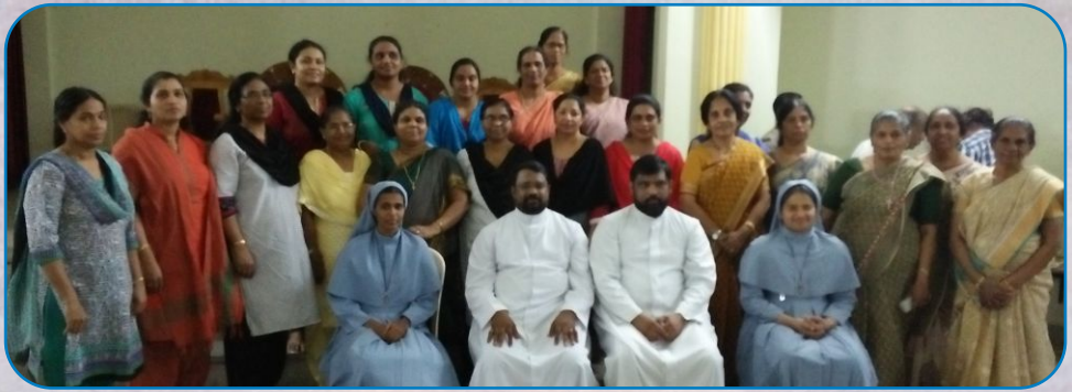
Pune District Mathrusangham Senate