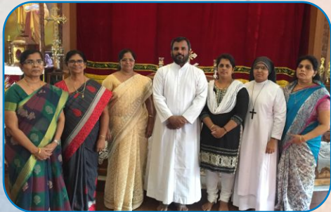
Bangalore District Mathrusangham Executive Committee