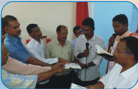
Oath Taking by the New Committee, Dombivali