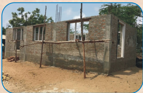
Church Construction in Bapatla