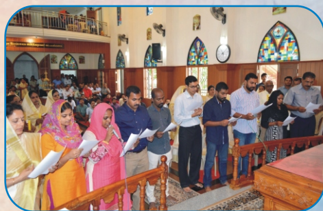
Bangalore District MCYM Oath Taking