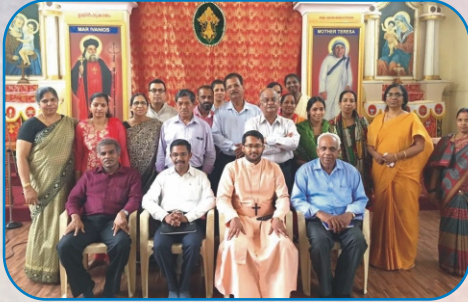
District MCA Representatives' visit to Warje Parish