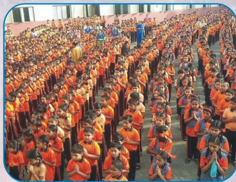
St Joseph's Bethany Convent School, Ambernath