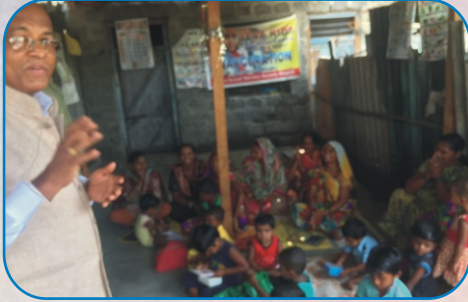
CNEWA Director with Seva Kids