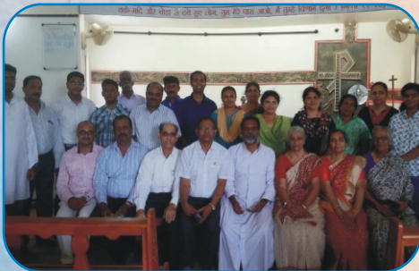
Suvisesha Sangham Formation, Nagpur & Padi