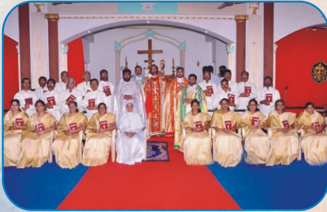
Suvisesha Sangham kaiveppu, Mumbai & Bangalore