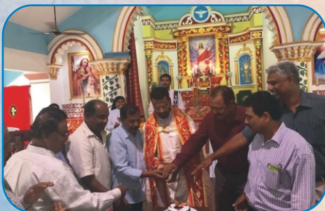
Father's Day, Dehuroad