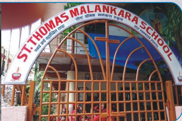
St Thomas Malankara School, Dahisar (W), Mumbai -68