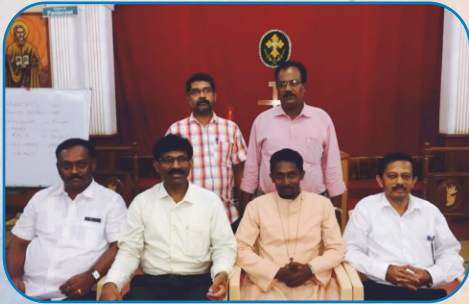
Mumbai MCA Secretariat