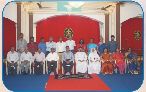
Parish Committee, Sakinaka