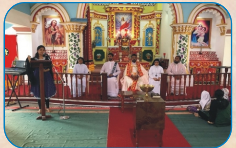
Welcome & Farewell to Rev Brothers & Sisters, Dehu Road