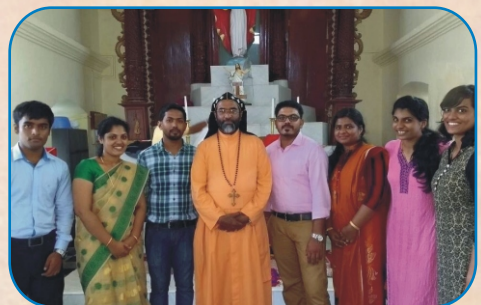
Goa MCYM with the Aboon