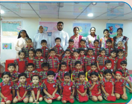
St Mary's Malankara School, Asapha, Sakinaka, Mumbai