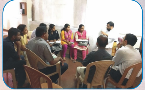
Director with Bangalore MCYM Secretariat