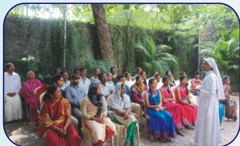
Hindi - Marathi Community