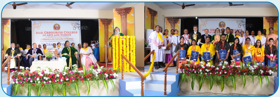
Graduation Ceremony at Mar Gregorios College, Chennai