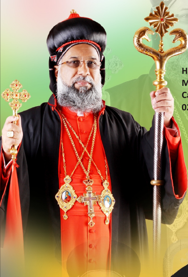
His Beatitude Moran Mor Baselios Cardinal Cleemis Catholicos 02 January