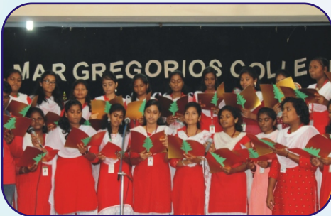
MG College, Chennai