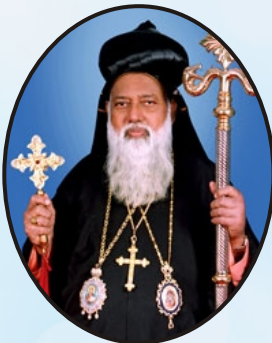
MORAN MOR CYRIL BASELIOS CATHOLICOS 18 January