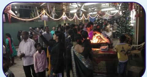
Praise and Worship