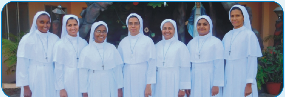
Prayers to the New Provincial Council of the Amala Province of DM Sisters, Wardha