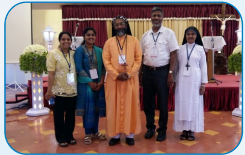
The Exarchial Team along with the Aboon at WRBC in Goa