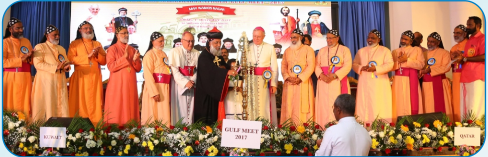
Polima Gulf Meet 2017 - Dubai