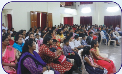
Catechism Students & Parents