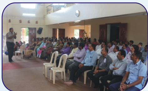
MCA & Mathrusangham