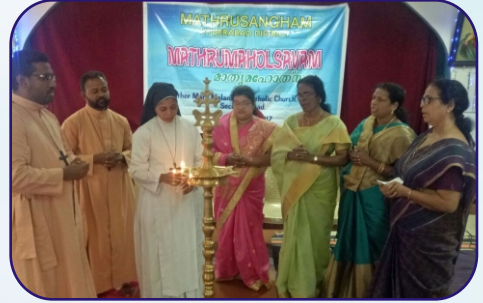
Mathrusangham Arts Fest, Hyderabad