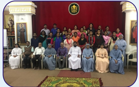
Sunday School Teachers' Orientation Program, Pune