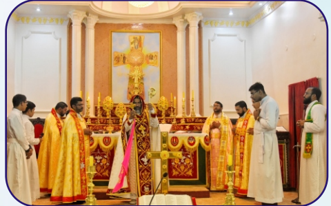
Ordination Day Celebration of Aboon