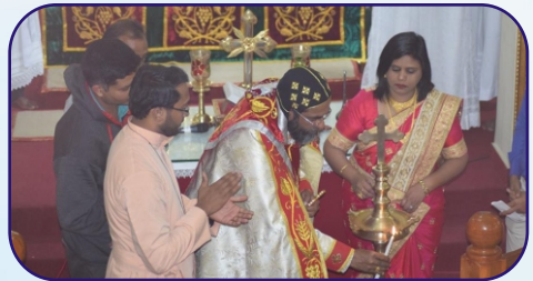
Inauguration of the Literacy Unit of SEVA