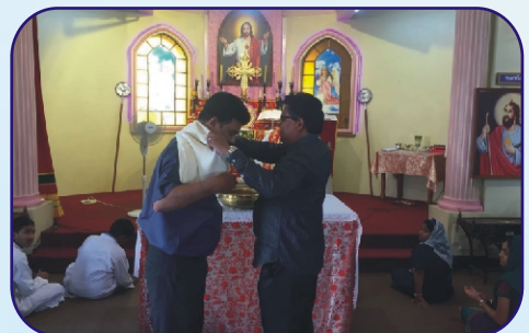
The MCYM Members at ECF Sports Meet & Felicitation of Senior Members of the Parish, Vishrantwadi