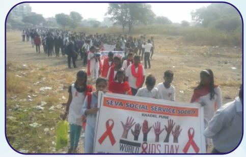
AIDS Awareness Class and Rally by SEVA, Pune