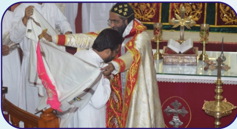
Aboon Felicitating the Tabor Retreat Team